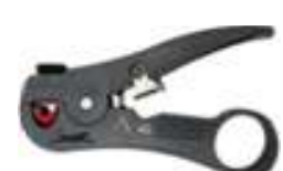
QuickTrex Large OD Cable Cutter Stripper