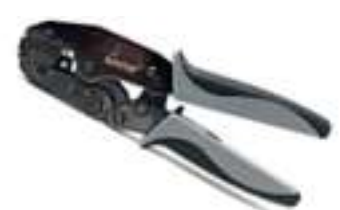
QuickTrex Large OD / Cat 8 Crimper