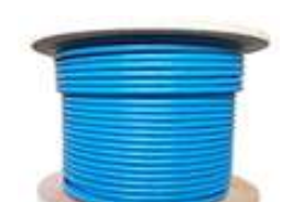
QuickTrex Cat 8 Cable