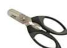
QuickTrex Wire Scissors