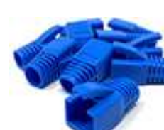
QuickTrex Cat 8 Strain Relief Boots (Optional)