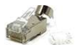
QuickTrex Cat 8 Modular Plugs